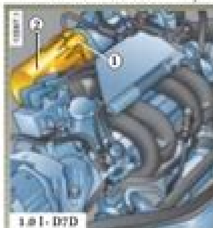
1.0 I - D7D