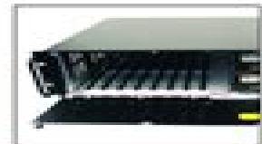
Eight slots for plug-in, hot-swappable port processors

As technology moves faster and faster, the MegaNAC 180 plays a strategic role in the Hypercom framework. Network owners know they can freely evolve from one technology to another with the assurance that yesterday's systems will seamlessly integrate into tomorrow's newest offerings.