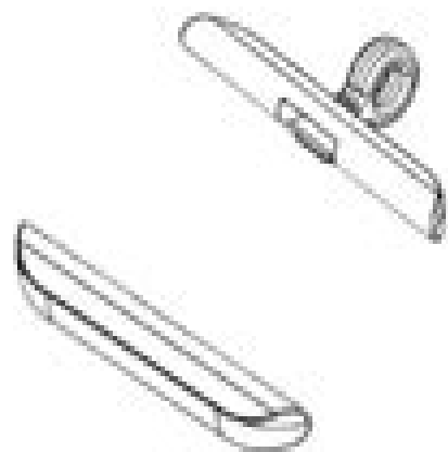
Pendant Inserts (Top and Bottom)