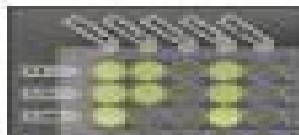
Microarray image showing GBS results. The image shows a grid of yellow spots, indicating the presence of DNA. The checkered pattern at the top indicates the presence of DNA. The labels on the left indicate the lanes, rows, and columns of the microarray.