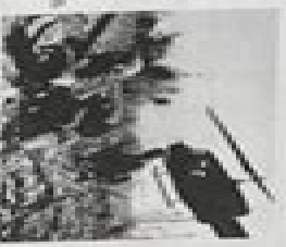
Combat in Vietnam

During the 1950s and 1960s, the United States helped another war against Communist forces in Asia—the Vietnam War. Vietnam is a country in Southeast Asia. It was divided into two sections—North Vietnam and South Vietnam. North Vietnam was controlled by Communists, and South Vietnam was controlled by a government friendly to the United States. The communists in South Vietnam wanted to take over South Vietnam.