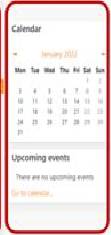
Right information blocks.