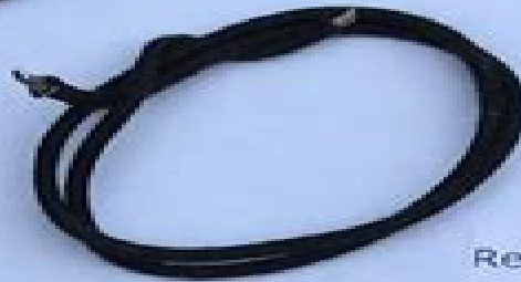
Red & Green ZW Lens Cap (2) 51 Bulbs