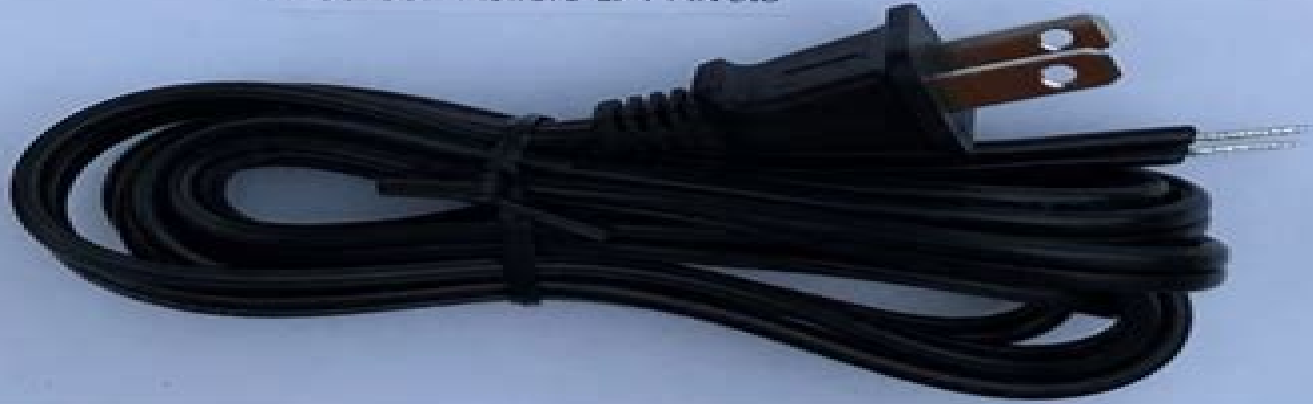
B-292 "L" Power Cord