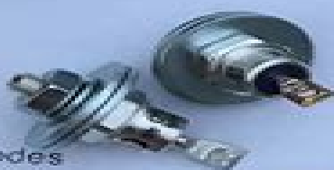
(2) 16 amp stud diodes