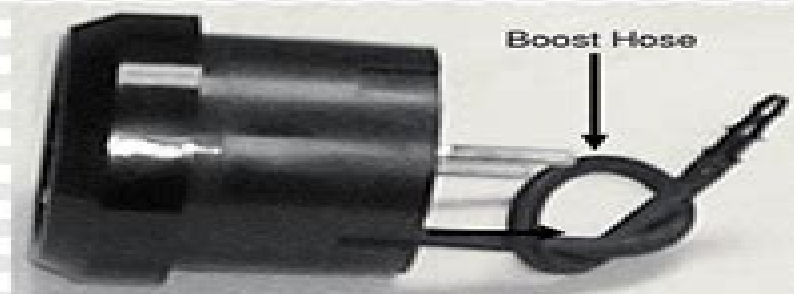
Figure 3. Boost Hose

The boost hose protruding from the back of the gauge is connected to the on-board pressure sensor. See Figure 3. When using the on-board pressure sensor, the boost hose must be connected to manifold pressure. Connect the boost hose to manifold pressure using the supplied tubing and 1/8" NPT barb or an existing manifold pressure port. (NOTE: Do not pull on the boost hose) See Figure 4 for a connection diagram.