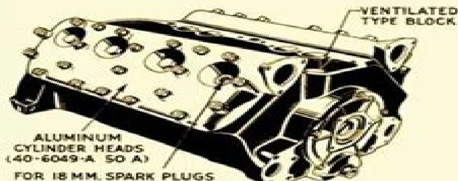
48-6012—(FOR 1935-36 PASSENGER AND COMMERCIAL CARS)