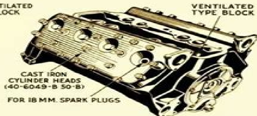
51-6012—(FOR 1935, 1936 TRUCKS)