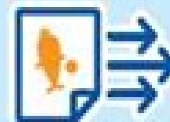
Program & Embed