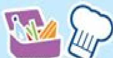
Healthy Menus & Lunchboxes