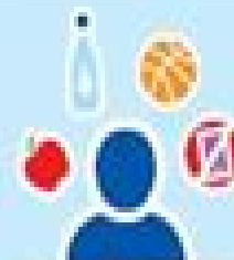
Staff Role Modelling