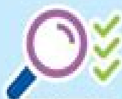
Monitor & Feedback