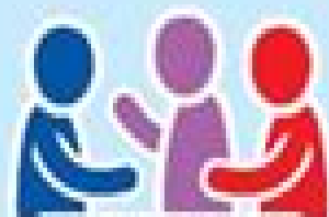
Local Health District Support