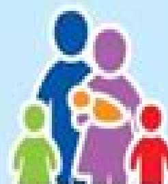
Partnerships with Families