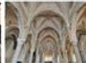
3 – Da Vinci Museum