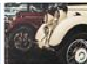
2 – Transport Museum