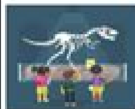
1 – Nature Museum