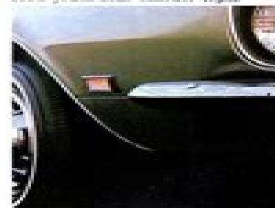
New front side marker light