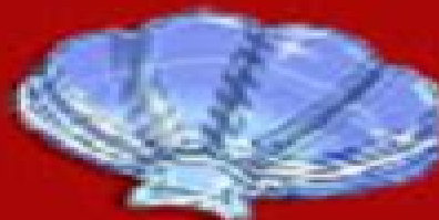
1 Sea Stone