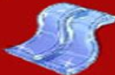
1 River Ripple