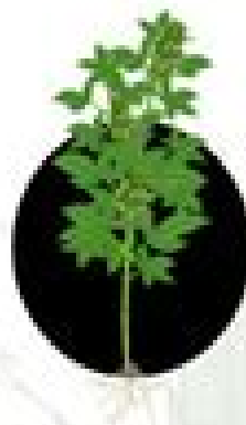
PLANT WITH FLOWER