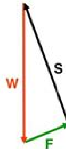
Triangle of forces