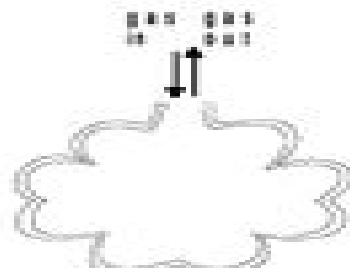
damaged air sac