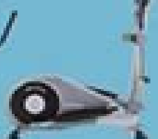
GH-190 18 inch