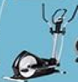
GH-180 16 inch