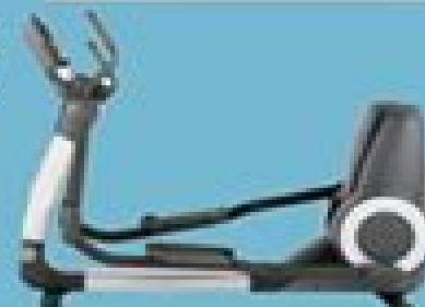
EC-1450 20-24 inch