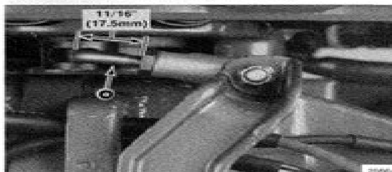
a - Trigger Link Rod

IMPORTANT: If trigger link rod was disassembled verify that 11/16 in. (17.5mm) is retained.