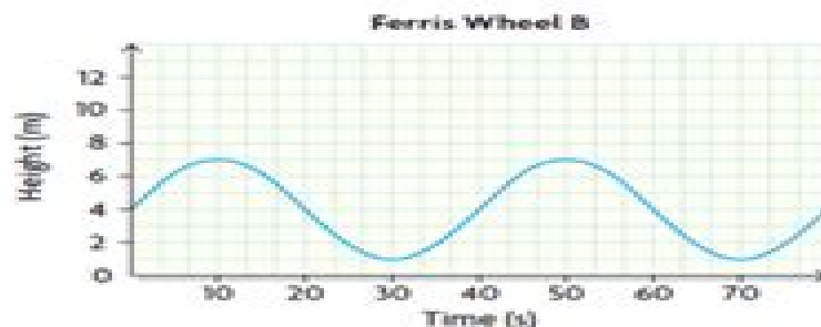
Ferris Wheel B