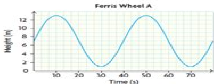
Ferris wheel A

Example: Two Ferris Wheels are at a country fair. Answer the following questions for each of the following graphs: