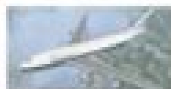
Boeing 747-400 Decommissioned