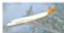
Boeing 747-400 Orbit Airlines