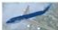
Boeing 747-400 World Travel Airlines