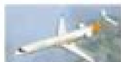
Bombardier CRJ700 Orbit Airlines