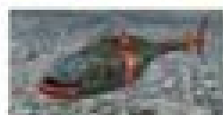
Bell 206B JetRanger Swedish Air-Sea ...