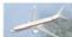
Boeing 737-800 Unmarked Airliner