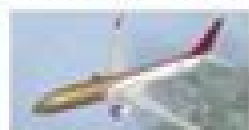
Boeing 737-800 Pacific Airlines