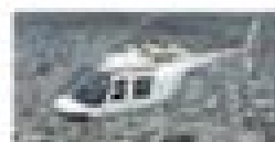
Bell 206B JetRanger White