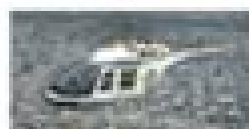
Bell 206B JetRanger TV News (fictional)