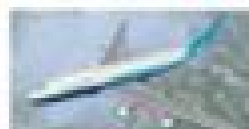
Boeing 747-400 Boeing livery