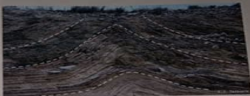
▲ Figure 6.24 Photograph to accompany Question 4.