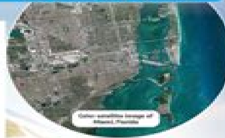
Aerial satellite image of Miami, Florida

Geographers also use maps to find the location of a place. A map is a picture of a place. Geographers use a map to find the location of a place. A map is a picture of a place.