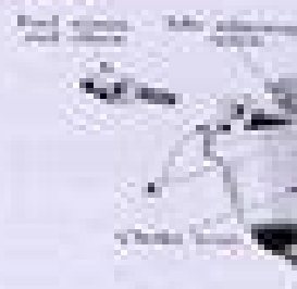
Figure 14. Fuel system assembly.

The function of the carburetor will be discussed by breaking down into the following system or parts: the fuel supply system, the air system, the fuel jet system, and the choke system.