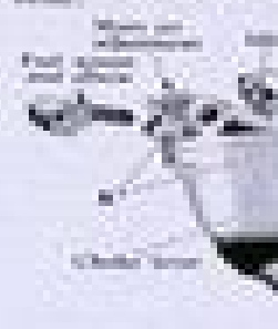
Figure 15. Fuel system assembly.