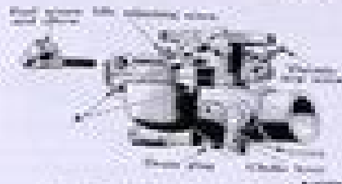
Figure 12. Fuel system assembly.