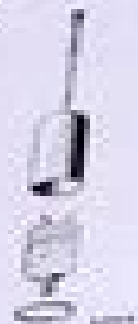
Figure 10. Fuel nozzle assembly.