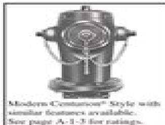
Modern Centurion® Style with similar features available. See page A-1-3 for ratings.