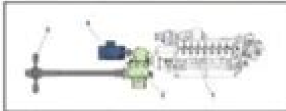
Figure 7.7.3: Power take-off (PTO) or power take-in (PFI), gear driven

Top mounted auxiliary PTO or PFI are for high power, e.g. for workboat application, automobile or bus PTO/PFI speed, rotation, torque capacity-variant requests.