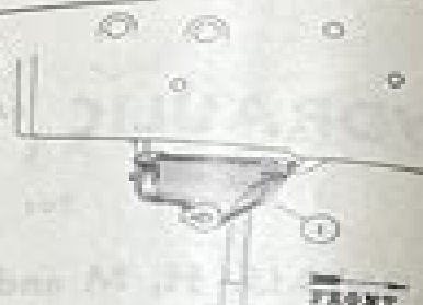
Illustration No. 1