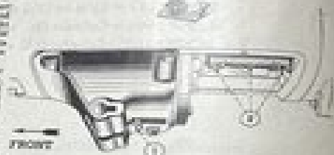
Illustration No. 2