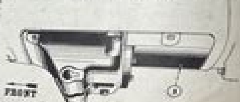
Illustration No. 3