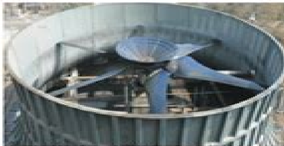
Fig.-1. A top view of CT showing fan and stack.

Thermal power plants use a significant volume of water to dissipate the heat of the hot water received from the condensers. Cooling tower (CT) are used in thermal power plant to cool the circulating water are an important part of power plants as it has direct impact on unit efficiency. Induced draft cooling tower as shown in Fig. 1 which required fan to create the draft across inlet and outlet of the tower IDCT fan availability is vital for the power plant efficiency as well as to keep unit running. The fan assembly consists of fan blades, hub plate and holding V-block gear box and drive shaft shown in Fig. 3.