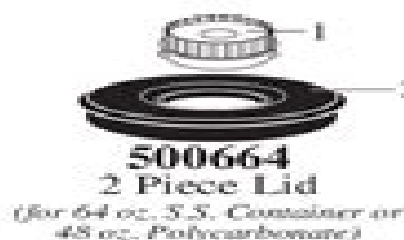
500664 2 Piece Lid (for 64 oz. S.S. Container or 48 oz. Polycarbonate)