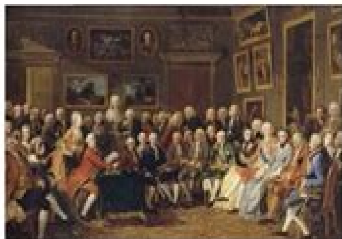
Un salon de Madame Geoffrin, peinture de L. Lantier, 1887, Paris