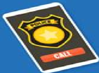
Emergency phone numbers