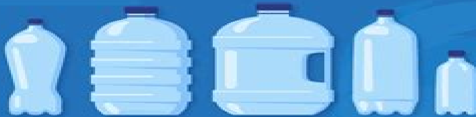
Plenty of water