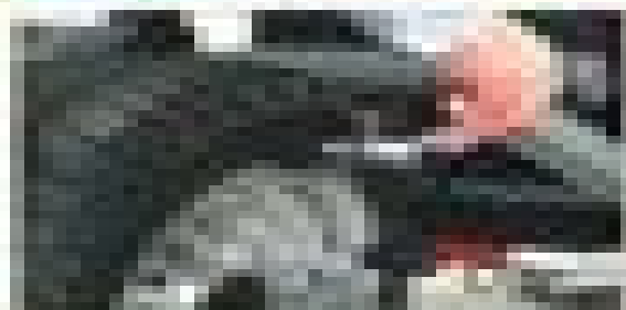
The control panel and monitor are located on the side of the machine.

H unter's new GSP6500 CRT balancer is a mid-range machine that offers QuickMatch™ match-mounting, a feature that allows for easy wheel changes. The machine is designed for use in a variety of applications, including automotive, industrial, and commercial. It features a large, black, heavy-duty wheel that is mounted on a red base. The machine is controlled by a computer system that is located on the side of the machine. The computer system includes a monitor and a control panel. The monitor displays the balance results, and the control panel allows the operator to adjust the balance.