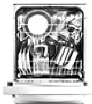
DISHWASHER CAPACITY - 12 PLACE SETTINGS