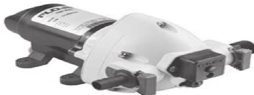
Model 3426 / 3526 / 3626 Series