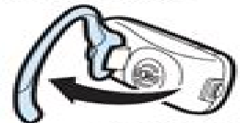
1 Open Earhook