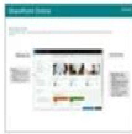
SharePoint Online View SharePoint Online PDF