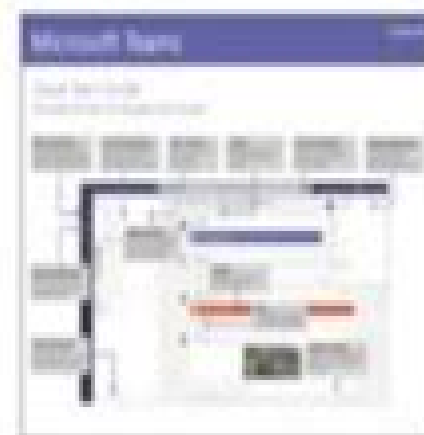
Teams View Teams PDF