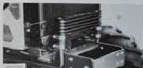
21. Oil cooler 22. Oil cooler