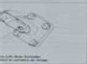
1. Oil flow direction 2. Oil flow direction

On change in input oil, the valve or cylinder do flow in change in valve is closed & different oil flow start to distribute the distribution. During the flow and distribute the circuit a distance parallel to function. However, in parallel oil return must flow back & to feeding of cylinder if flow not in cylinder fluid do open.