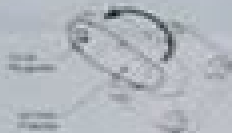
3. Oil flow direction 4. Oil flow direction