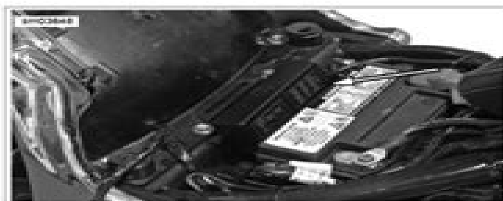
Figure 8-11. Fuse Block Cover (FXCW/C)