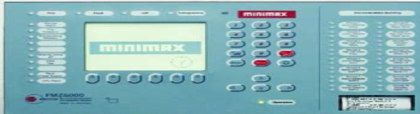
FMZ 5000 Fire detection and extinguishing control panel