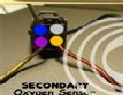
SECONDARY Oxygen Sensor