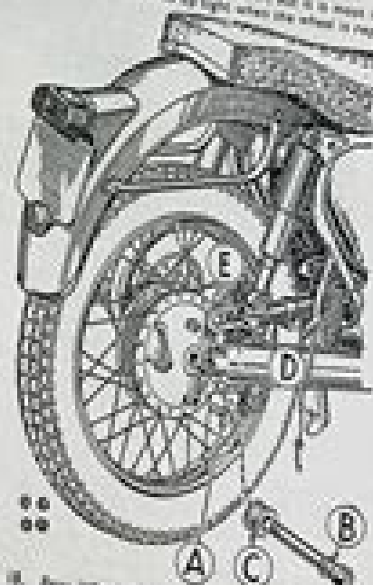
Fig. 18. Rear Wheel Removal and Rear Chain Adjustment.

To remove the rear wheel, place the machine on its stand. Take off the nut (A) Fig. 18, so free the brake anchor screw and disconnect the brake cable. Unscrew the four retaining nuts (B) Fig. 18, leaving the wheel on the chainwheel. On machines fitted with a fully enclosed chaincase, this operation is carried out after removing the rubber plug (C) Fig. 19. Then, place a spacer bar in the spindle end as (D) Fig. 18, and unscrew in an anticlockwise direction until it can be withdrawn. The spacer plate (E) can then be removed and the wheel can be withdrawn to the right, when it can be taken downwards and rearwards. Note that the large nut (A) Fig. 19, on the left-hand end of the spindle retains the chainwheel and should not be disturbed. Reassembly is carried out in the reverse order, but it is most important that the four retaining nuts are screwed up tight when the wheel is replaced.