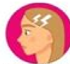
CHANGES OF MOOD