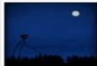
War of the Worlds