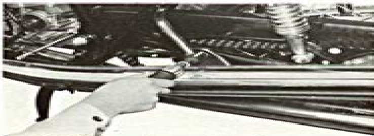
Fig. 7-1-22 Removing rear footrest

Remove the left and right cylinder head covers in order that these do not hinder when dismantling engine.