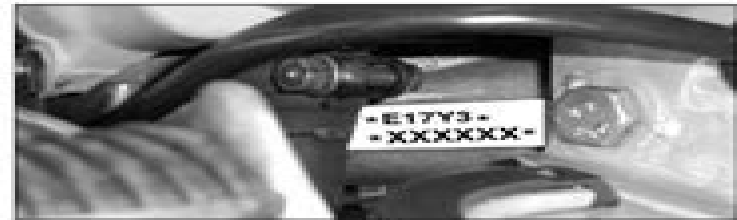
Fig. 2 Engine Identification Number

The engine number is stamped on the crankcase (Fig. 2), and will have the prefix E17...3 followed by 8 characters.