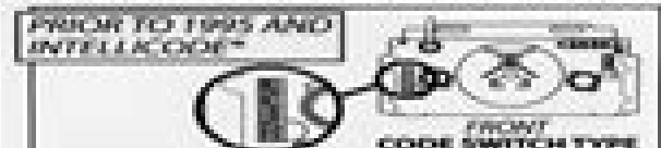
FIG. 1. POWERHEADS (for various models) Circle shows location of Learn Code Button and LED.