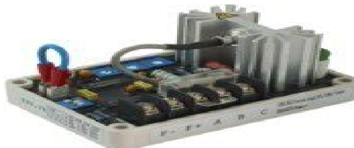
Self Excited Automatic Voltage Regulator 5 Amp AVR For General Generators