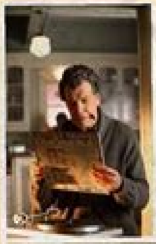
As a young scholar, he was involved in a number of different fields and disciplines, which he viewed as a natural extension of his research into the history of science and the philosophy of science.