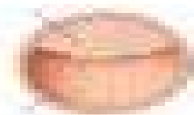
Human embryo at 8 weeks (approximate) with visible features