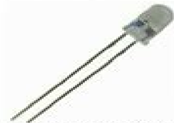
Light Emitting Diode