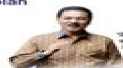
"PILIHAN SMA N 2 SUMBAR sebagai tempat belajar, memudahkan alumnus melanjutkan jenjang pendidikan kea berkeadilan" MENDAGRI Periode 2009-2014 Dr.H. Gamawan Fauzi, SH, M.M.